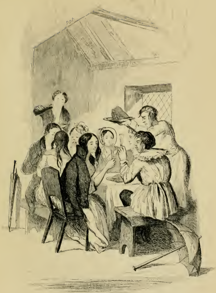
The Party at Killarney